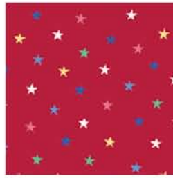
Fabric 2 Red Star