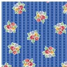
Fabric 4 Blue Stripe