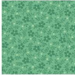
Fabric 1 Green Flowers